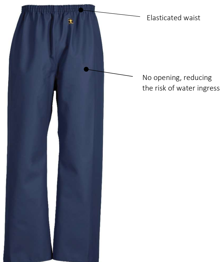
ILLUSTRATION AND INSTRUCTIONS