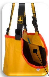
ILLUSTRATION AND INSTRUCTIONS

- Do not leave in package in damp surroundings. - Store in dry surroundings at room temperature. - Keep away from strong heat and flames.