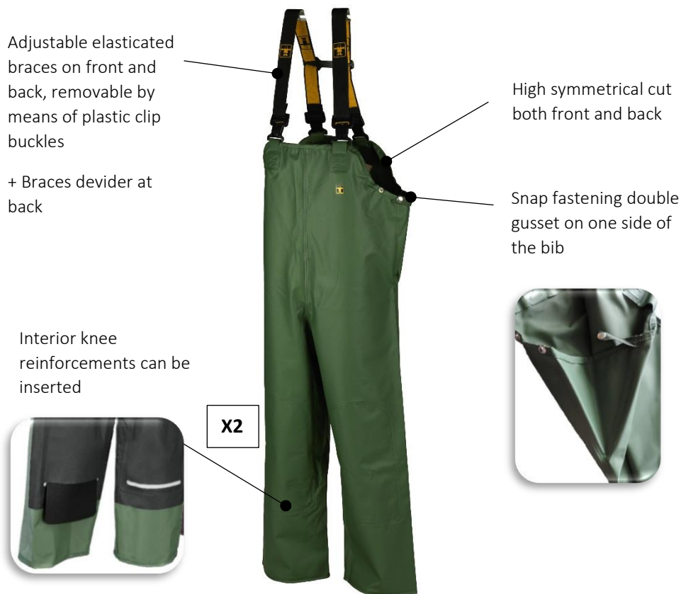
ILLUSTRATION AND INSTRUCTIONS

i For maximum protection, the BAROSSA 420 bib and braces trousers can be worn with a PPE classified jacket, smock or coat.