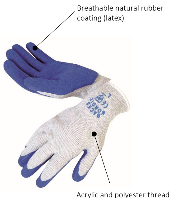
ILLUSTRATION AND INSTRUCTIONS