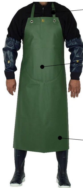
ILLUSTRATION AND INSTRUCTIONS

Plastic buckle adjustment of over-neck fabric strap