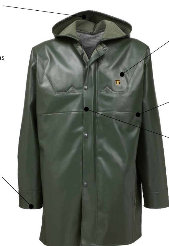
ILLUSTRATION AND INSTRUCTIONS

ISOLATECH technique (patented) reducing condensation under the all-weather gear