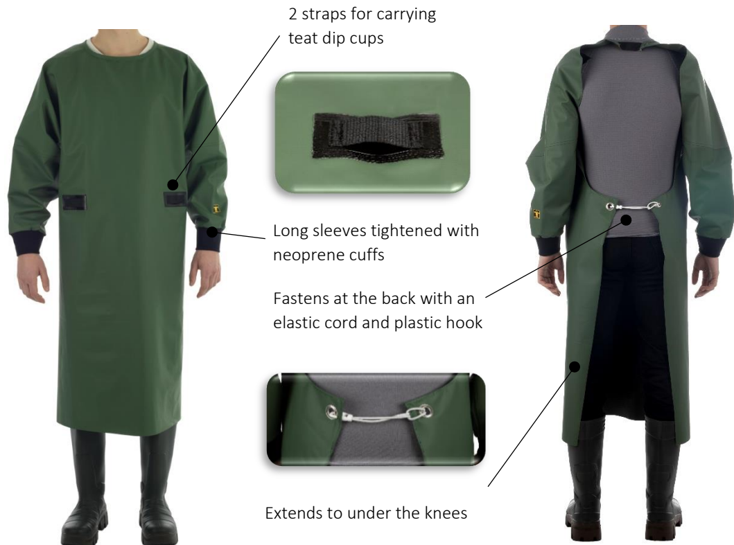
ILLUSTRATION AND INSTRUCTIONS