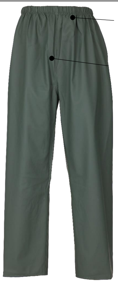
ILLUSTRATION AND INSTRUCTIONS