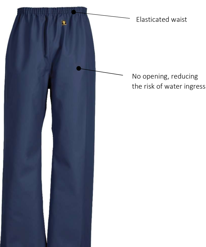
ILLUSTRATION AND INSTRUCTIONS